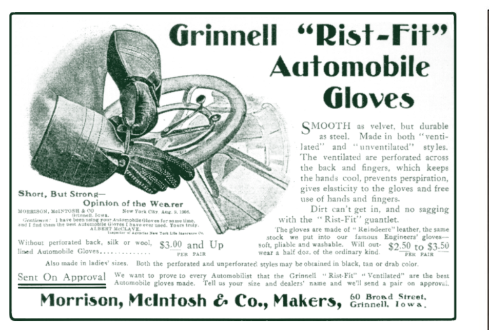
Figure 2b: Gloves and fur coats were a must for riding in early automobiles.<sup>1,2</sup>

was developed by DELCO using exhaust gas to generate steam. Its operation was similar to the steam house heating system. The system included a boiler at the muffler outlet. It was surrounded by exhaust gas with an average temperature of 900°F (482°C). One ounce of liquid water was placed in the boiler. Immediately upon starting the engine, the intense heat of the exhaust converted this liquid water into steam that rose to the heater core where the heat was convected into the passenger compartment by means of an electric fan. The steam returned to the boiler through the return line routed through the radiator to condense it. The pressure was automatically maintained at about 100 psia (690 kPa) by means of a patented control chamber that governed the amount of water in circulation.<sup>4</sup>