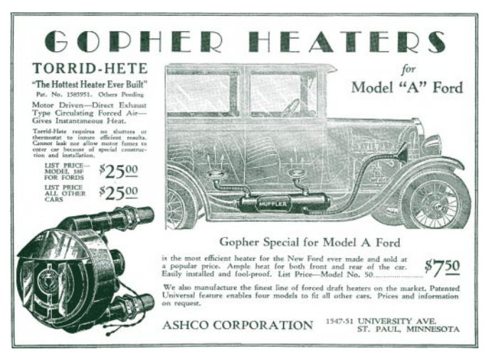
Figure 5: A high-performance exhaust gas heater used in 1929.<sup>2</sup>

Stewart-Warner developed the first successful gasoline-burning passenger car heater, known as Model 781, around 1937. It was mounted on the passenger side of the firewall and the outlet of the combustion chamber was connected to the intake manifold of the engine. The engine vacuum was used to draw air and fuel into the combustion chamber where the mixture was ignited by means of a glow plug. The exhaust products were drawn into the engine where unburned fuel was consumed. A small fan circulated the air over a finned heat exchanger.