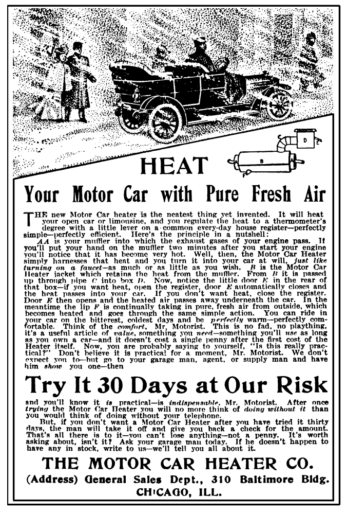
Figure 4: An exhaust gas heater used in open-body automobiles.

Harrison Radiator in 1939 released an underseat heater covered by U.S. Patent. No. 2,249,946. It reduced the congestion in the cowl and front passenger compartment and helped distribute warm air to the front and rear compartments. All General Motors Car Divisions adopted this type of heater for the 1939–1940 model year. In the same model year, Harrison Radiator also provided an accessory package to bring in outside air to the dash heater as described in U.S. Patent No. 2,342,901. It was used by Oldsmobile, Pontiac and Chevrolet.